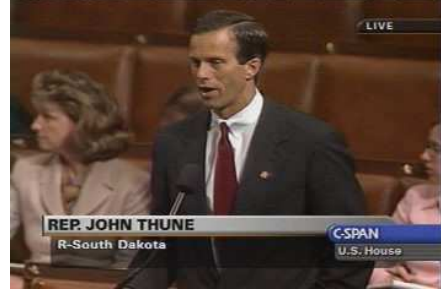
Fig. 1. A typical frame extracted from a C-SPAN program. The lower part with on-screen graphics is ignored when calculating the keyframe histogram feature.

For each shot we extract acoustic vectors consisting of the 20 mel-frequency cepstral coefficients obtained every 10 ms using a 20 ms Hamming window. Let \mathbf{x}^i = \{x^i(k) \in \mathfrak{R}^n, k = 1, \dots, N_i\} and \mathbf{x}^j = \{x^j(k) \in \mathfrak{R}^n, k = 1, \dots, N_j\} be acoustic vectors extracted from shots s_i and s_j , respectively, where N_i denotes the number of 10ms segments for shot s_i and n is the dimensionality of the