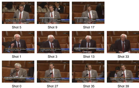
Fig. 4. Shots belonging to clusters 12, 13, and 14 from the sequence cspan17 . First and third clusters form a false split and the third cluster has a wrong grouping error.

In this paper we have described a system that uses multimodal features to detect unique people appearing in news programs and illustrated our results using data obtained from C-SPAN. For most programs our system is able to accurately detect the people in programs. However, errors may arise when the audio for a shot does not belong to the person shown in the shot. We are implementing measures based on audio continuity to solve this problem. We are also looking into learning algorithms to automatically determine weights for the three different kinds of shot distances to increase performance.